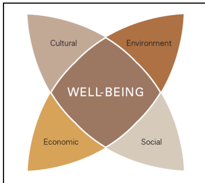
Figure 2 Relationship Among the Four Well-Beings

Ministry for Culture and Heritage (2005b).